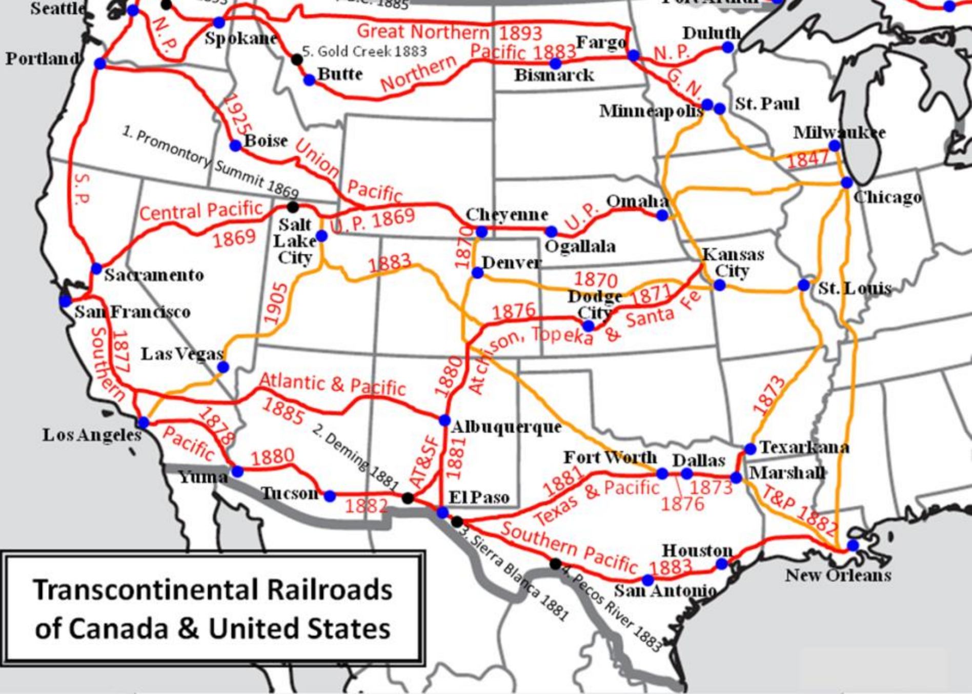
Transcontinental Railroads of Canada & United States